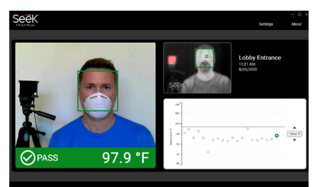
ESTIMATED BODY TEMPERATURE IS BELOW THE ALARM TEMPERATURE.