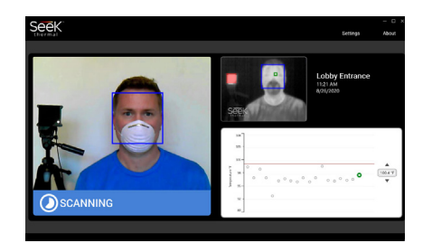
FACE DETECTED. SEEK SCAN IS MEASURING SKIN TEMPERATURE.